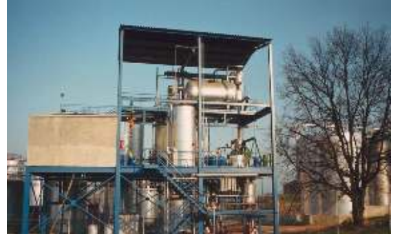
Figure 1: Partial hydrogenation unit

The disposal of excess hydrogen from the oil hydrogenation process is key to ensure safety of a process plant. The excess Hydrogen in combination with other trace gases is burnt through using an oxidizer. Hydrogen must be monitored within the exit stream to avoid surges or pulses in the burning process, which could cause fires or explosions. The end user's goal is to keep an on-going steady burn, thus keeping the hydrogen within a specific range. In addition, the process hydrogen needs to be monitored to ensure that the hydrogenation process is efficient prior to the oxidizer.