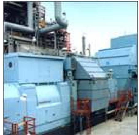
Figure 2: Typical generator cooled with Hydrogen