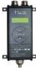
Model HY-ALERTA™ 1600

Hydrogen leaking into the area surrounding the hydrogen generator could make the containment room potentially explosive. HY-ALERTA™ 1600 installed in generator rooms will ensure safe operation of generators. Programmable alarms, relays and system integration are available options.